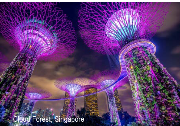
Cloud Forest, Singapore