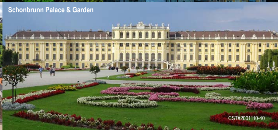
Schonbrunn Palace & Garden